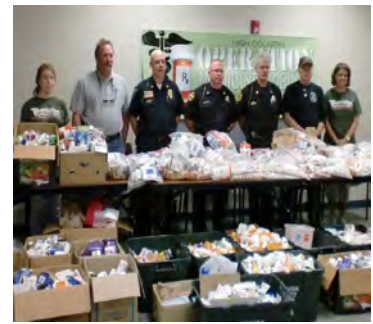
Drug Take-Back Event

To dispose of prescription and over-the-counter drugs, call your city or county government's household trash and recycling service and ask if a drug take-back program is available in your community. Some counties hold household hazardous waste collection days, where prescription and over-the-counter drugs are accepted at a central location for proper disposal.